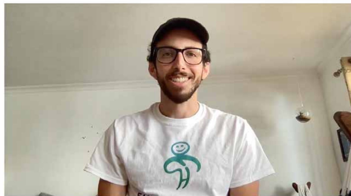
Example Video Setup (We'll let this logo slide because it's so cute)